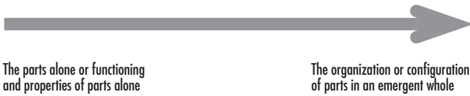
Figure 1 Continuum of emergence explanations

along with, not in exclusion to, appeals to the functioning of the parts of a system. In fact, it is often the very interplay between the parts and the whole that has been emphasized in studies of complex, self-organizing systems (see Lewin, 1992).